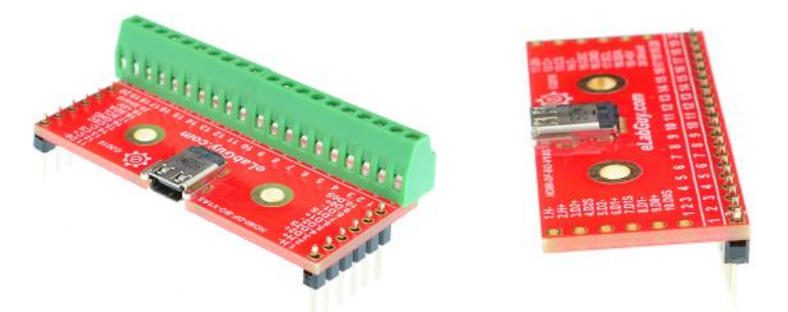
Figure 3: HDMI-DF-BO-V1AS Various connections